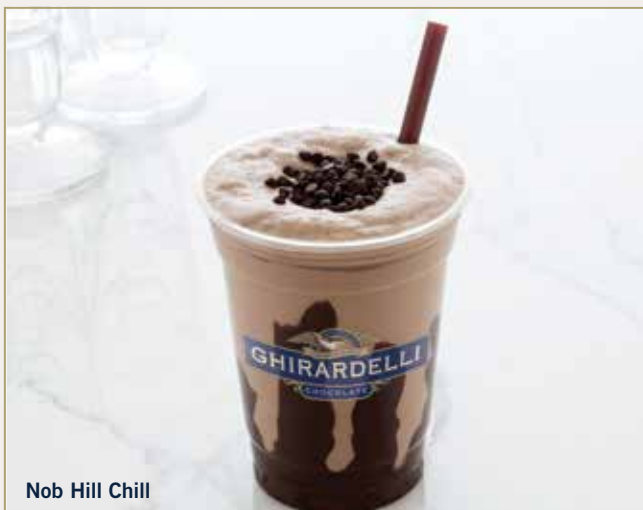
Nob Hill Chill

A blended beverage made with raspberry sorbet, club soda, ice and strawberry topping.