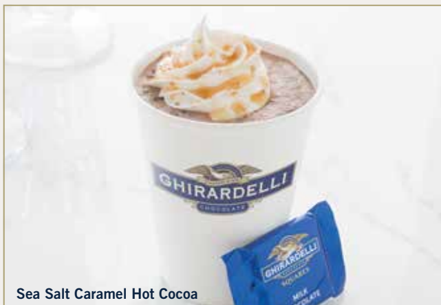
Sea Salt Caramel Hot Cocoa